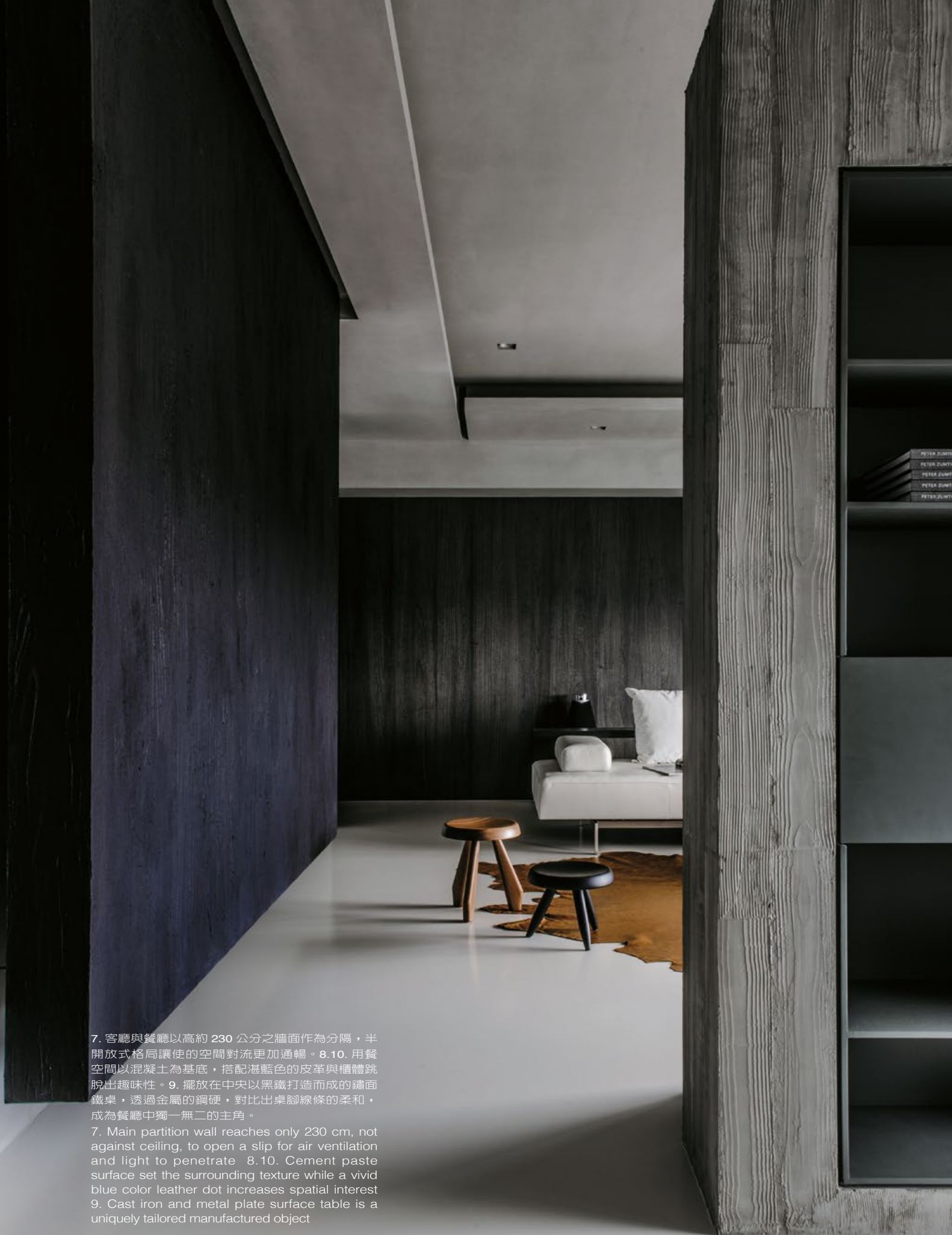
7. 客廳與餐廳以高約 230 公分之牆面作為分隔，半開放式格局讓使的空間對流更加通暢。8.10. 用餐空間以混凝土為基底，搭配濕藍色的皮革與櫃體跳脫出趣味性。9. 擺放在中央以黑鐵打造而成的鑄面鐵桌，透過金屬的錫硬，對比出桌腳線條的柔和，成為餐廳中獨一無二的主角。