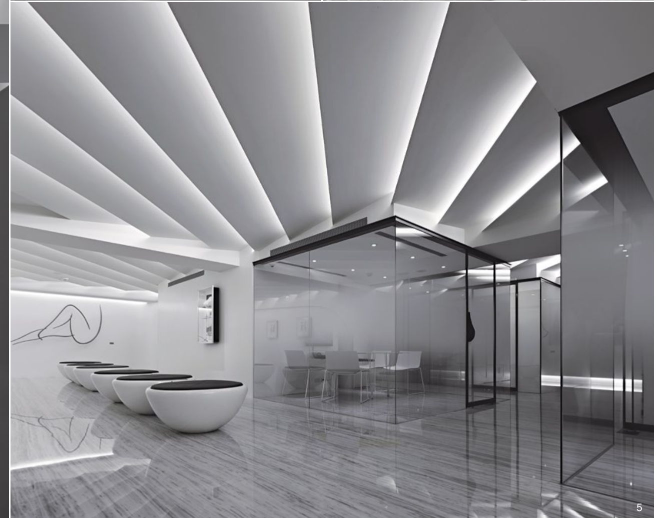
2. White wall and rich motif represents a romantic trip to beauty 3. Exit door is painted in a cartoon image like a human face 4. Geometrical patterns dominate the gallery view 5. Consultation rooms appear like glass boxes

無色罄然、嫣紅粉黛不入，櫃體和立面勻淨素稿並潤成有機長弧線，迤邐流瀉形貌似白幟風吹幡動，疊片天花則呈45度角做摺扇式排列，形廓隱喻著人體肋骨組織；最後向端景處凝眸，則以“Will Clift”一座素描式女體雕塑為韻尾。流眄盼睽整個藝廊，用色淡麗清湛，僅灰紋大理石形跡若躡砌於地面，偌大環境，彷彿取材料靜定做白描。唯線條演繹不離形隨機能之思，李智翔指出：「空間樑太低，肋骨式排列天花因結構錯開，一來能露出縱深，二來能避免制式包覆，所以空間不能配嵌燈，利用天花斜剖層疊，讓光從空隙透出來，形成間接照明。」