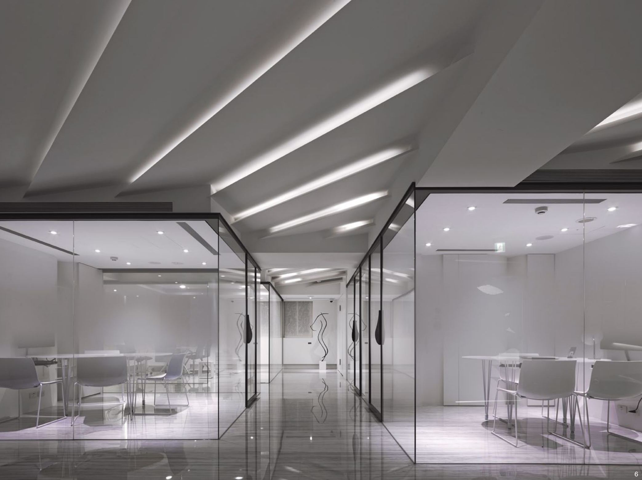
6. 立面為電漿玻璃，通電後的霧化效果能創造隱私。7.8. 放置諮詢室內外，門把手水滴狀造型學繪自乳房。9. 桌體勾勒胚胎輪廓，筆槽以鮮橘做跳色點綴；牆面書架則有乳、臀線隱喻。