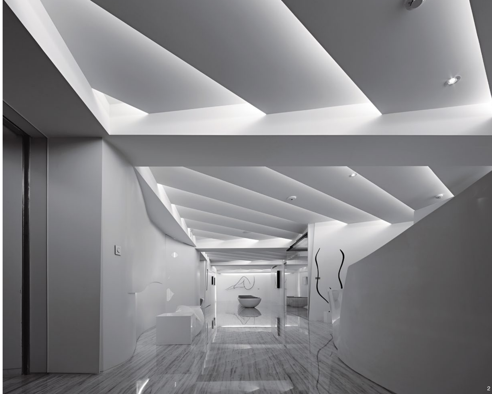
2. 純白襯底佐以豐沛線條，既顯神話浪漫又洋溢科技感。3. 逃生門以法式插畫概念，抽象描出眼、鼻、唇輪廓。4. 藝廊內有機與幾何線條相激盪。5. 諮詢室以玻璃盒子態樣打造，讓水平軸線延續無礙。