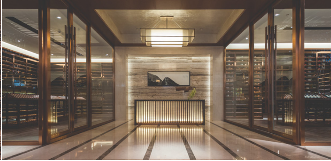
3. 半通透的隔間形式。4.5. 公共區與接待櫃台。6. 左側是酒窖。 3. Partially open partition 4.5. Reception and public zone 6. Wine cell in the left