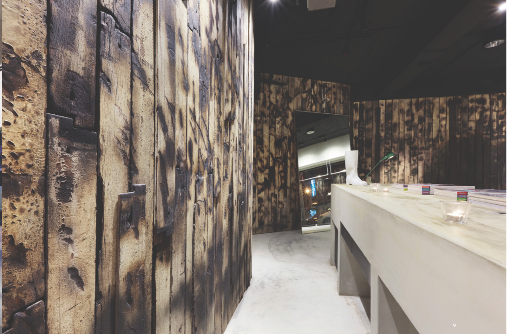
8. 原木柱豐富了動線變化，就像穿梭於倒掛森林中有趣。9. 立面使用大量的廢板材，經過炙灼、煙燻的處理，帶來豐富的表情。10.11. 細部。12. 材質的冷與熱，再生與原生的對照，為空間層疊出有趣的視景。13. 空間透過實際的廢料再生運用，傳達對物料本真面貌的探索以及對環保議題的思考。