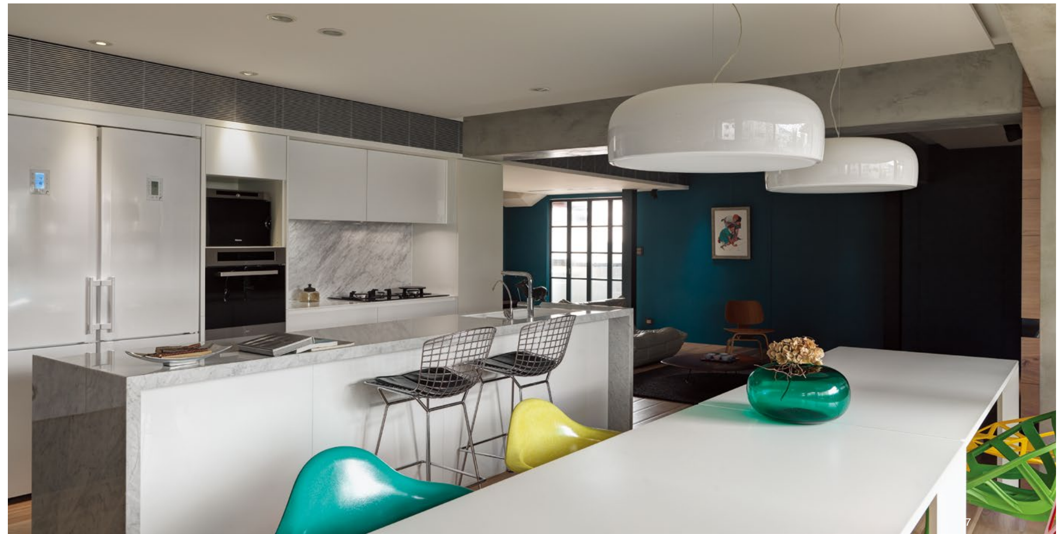
6. 客廳與遊戲區之間僅用沙發區隔，方便屋主關照孩童動態。7. 以餐廚空間為主導，開放、明亮的環境條件予人愉悅感，引起佇留欲望。8. 寬闊舒適的餐廚空間，也是女主人舉辦讀書會的活動用地。9. 玄關，立面使用細切大理石施作亂紋拼接，天花板刻意脫開，讓間接光源溫柔灑落。 6. A sofa set divides the living room and play room 7. Kitchen and dining room play a central role 8. Ample kitchen and dining room offers the best convenience for the wife 9. Details of fragments of the marble lobby wall and ceiling formation

In the dining room, one finds the typical Stephen's polished style was slightly modified; he hung several paintings in the space and selected bright color dining chairs. He confessed this created a scene to him where family members can gather around the table where kids are drawing and tasty cookies are placed on the table. Stephen believes that the challenge of home design is to enhance the way of a client's daily living experience yet also providing and opportunity for family member to accept a new way of life when encounters changes in their daily habits.