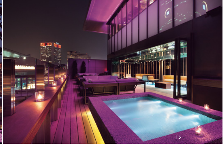
13. 戶外露臺，享有面對臺北101毫無阻礙的全露天景觀。14. 戶外露臺，帳篷與座椅均採用純淨色系，藉以襯托賓客與都會夜景。15. 戶外露臺，水池與獨立包廂，環繞露臺區的木長檯也可作為短暫休憩的邊靠。16. 戶外露臺，規劃獨立吧檯滿足宴飲需求。 13. Balcony: a tremendous view facing a rising Taipei 101 14. Balcony: seating design and the beauty of its extended cityscape 15. Balcony: reflective pool and an independent box space for customers 16. Balcony: independent bar space offering soft drinks to customers