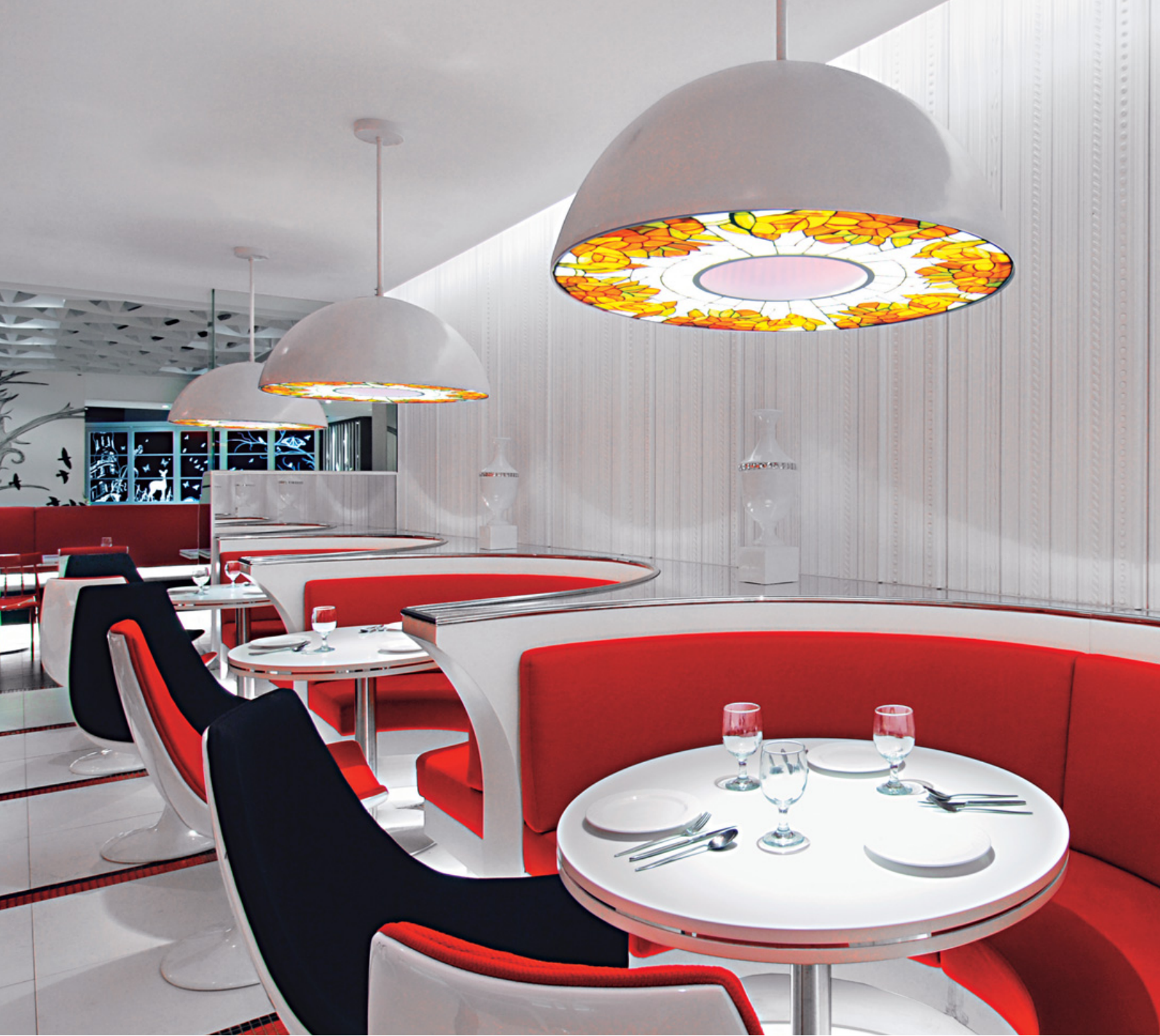
3. 透過空間純淨白色所蘊生的舒適感，不僅統合了複雜的造型元素，也讓各個角落裡的趣味細節產生點睛效果。4. 廊道式座區置入環形卡座微妙的區隔出領域感。 3. White colors appear in a crucial position balancing the sharp contrast of the spatial complexity 4. Circular chairs demarcate a space of belonging