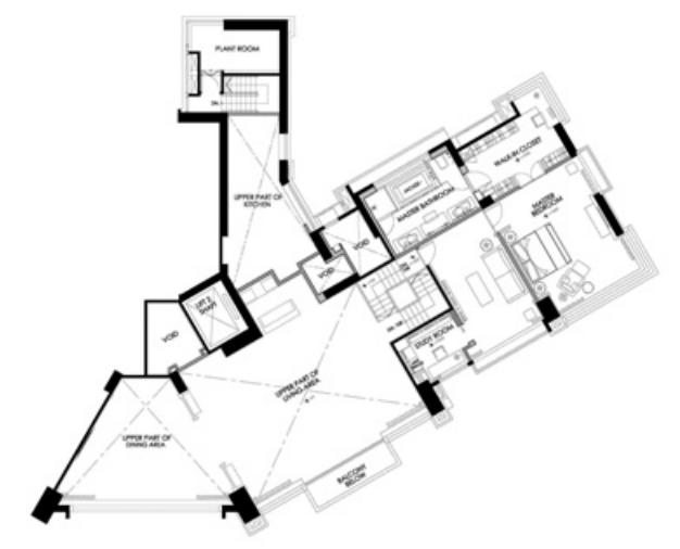
4/E UPPER FLOOR LAYOUT PLAN