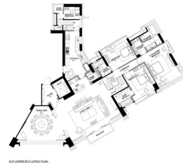
4/E LOWER FLOOR LAYOUT PLAN