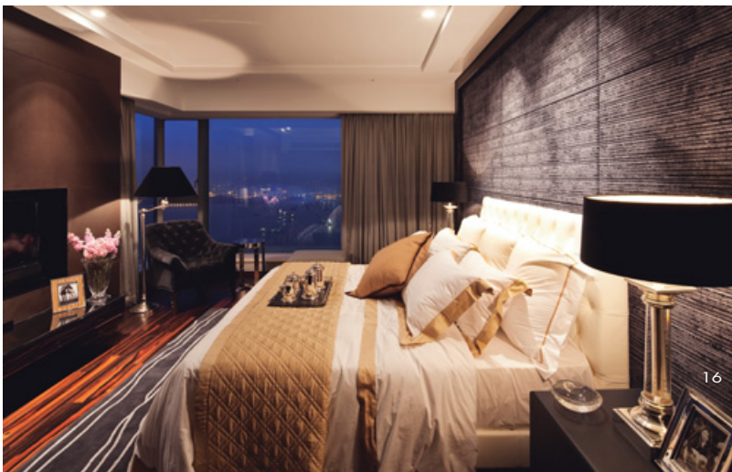
12. 男孩房透過床頭的黑檀木書架展露陽剛氣息。 13. 主臥衛浴室鋪砌聖羅蘭雲石地板、銀色馬賽克 框飾、黑玻璃牆面孕育時尚氣息。14. 男孩房以深 色調性為主。15. 主臥房細部。16. 主臥房以米灰雙 色鋪陳雅致調性。 12. Black sandalwood bookshelf in the boy's room provides a rustic fashion 13. Master bathroom and its surface cladding materials 14. Boy's room is dominated by dark color 15. Details, master bedroom 16. Beige color is the main tone of the master bedroom