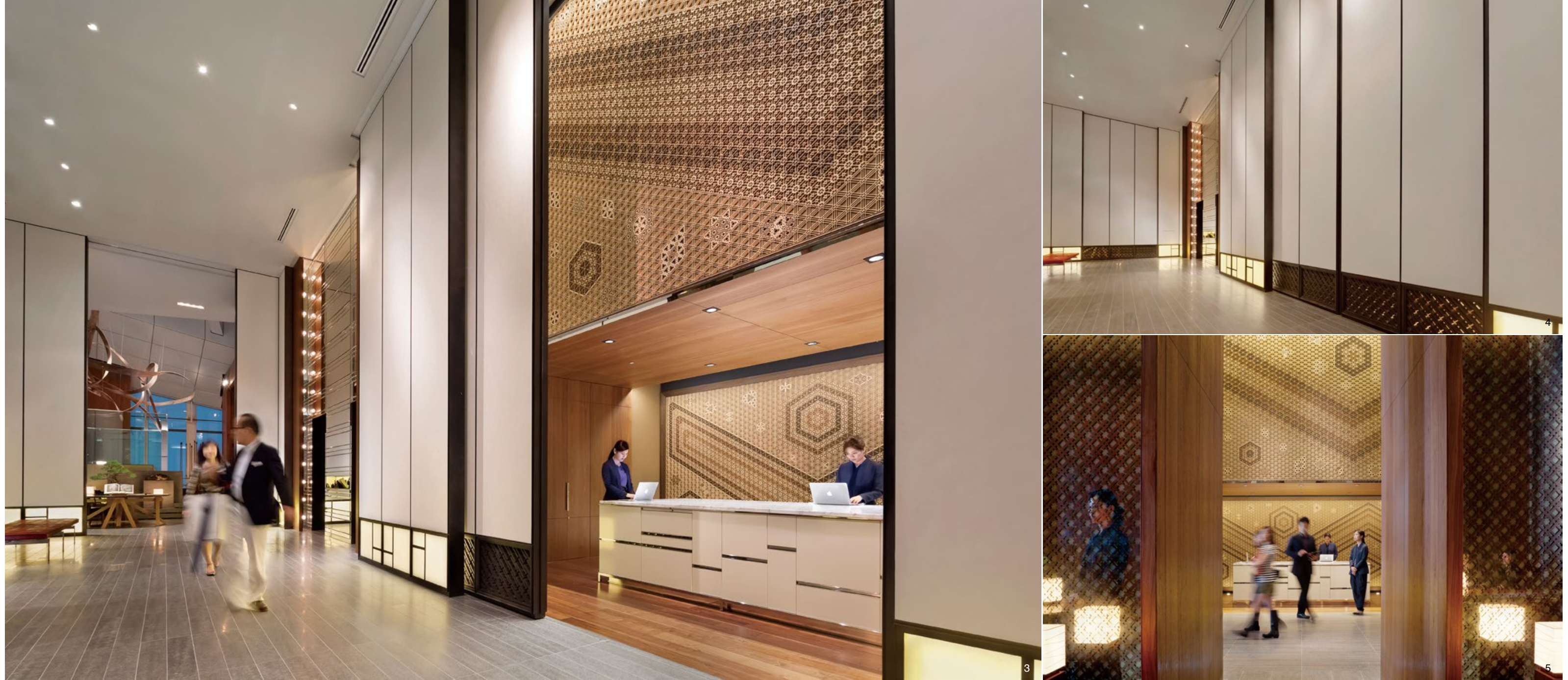
3. 位於高樓層的接待大廳，素縞和紙門搭配精緻工藝的裝飾立面，讓大廳空間深富雅韻。4. 以和室房概念擊劃出的大廳空間，在長方盒子三個口的格局中體現了設計至簡。當門闔上後，整個場域頓顯侘寂意境。5. 從大廳另一端望向接待檯，空間線條洗鍊無贅。6. 位於飯店一樓的 BeBu Cafe & Bar，溫潤胡桃木與璞真玄武岩，在美感上相輔相成。7. 飯店內的糕餅坊 Pastry Shop 規劃在建築街道層，並利用大尺幅落地窗引入都會明媚氣息。