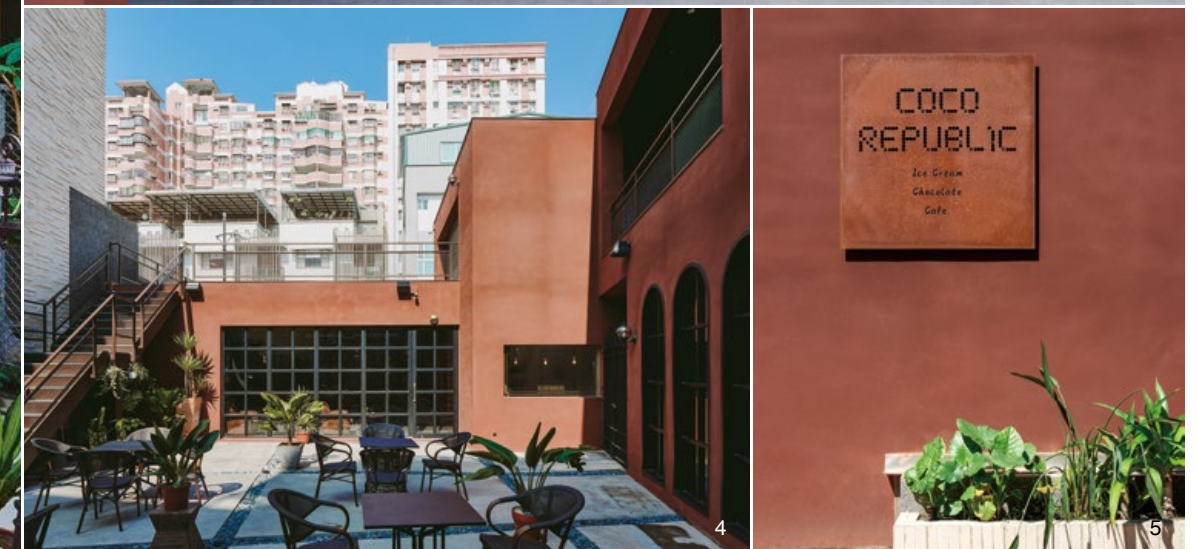
2. V形建築裡涵養偌大中庭，搭配大扇落地窗，讓室內可賞翫中庭動態。3. 建築外觀從採疊的巧克力塊產生靈感，創造出幾何式錯層輪廓。4. 南台灣四季多晴，適宜露天餐區的配置。5. 建築外觀襯以一襲棕褐色皮層，讓人直觀地聯想到店屬性與巧克力風味。6. 建築概念圖。