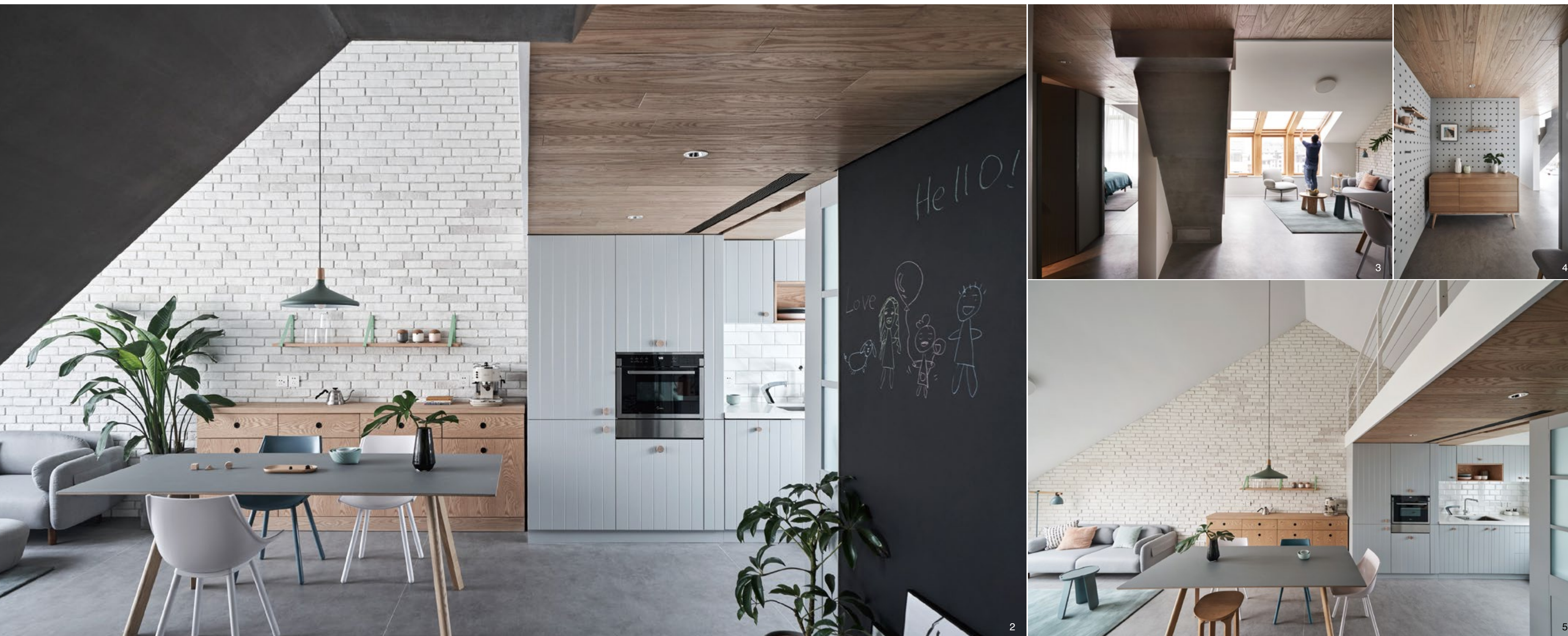
2. 開放式的餐廳與廚房，兩者間配有活動式拉門，可避免料理時油煙溢散問題。3. 玄關入內後的夾層下方空間，灰色樓梯結構彷彿自水泥粉光地板生長而來。4. 玄關立面以活動式的插梢與層板取代木作收納櫃。木質天花則創造一種歡迎和溫馨的氣象。5. 挑高的斜屋頂是本案特徵所在，天花結構之美再襯上壁面仿舊文化石，營造舒適氛圍。6. 一樓平面圖。7. 夾層平面圖。