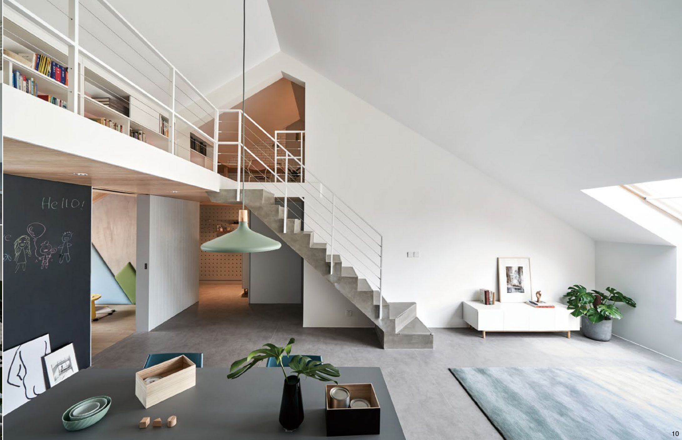
8. 斜屋頂的結構輪廓搭配斜角窗，讓空間明亮之餘更洋溢閣樓意趣。9. 為了豐富白色空間層次，設計採樂土水泥、塑膠地磚、仿石材磚等灰色調創造質地漸變。10. 設計斟酌挑高而拉出夾層空間，以利更有層次的生活機能劃分。