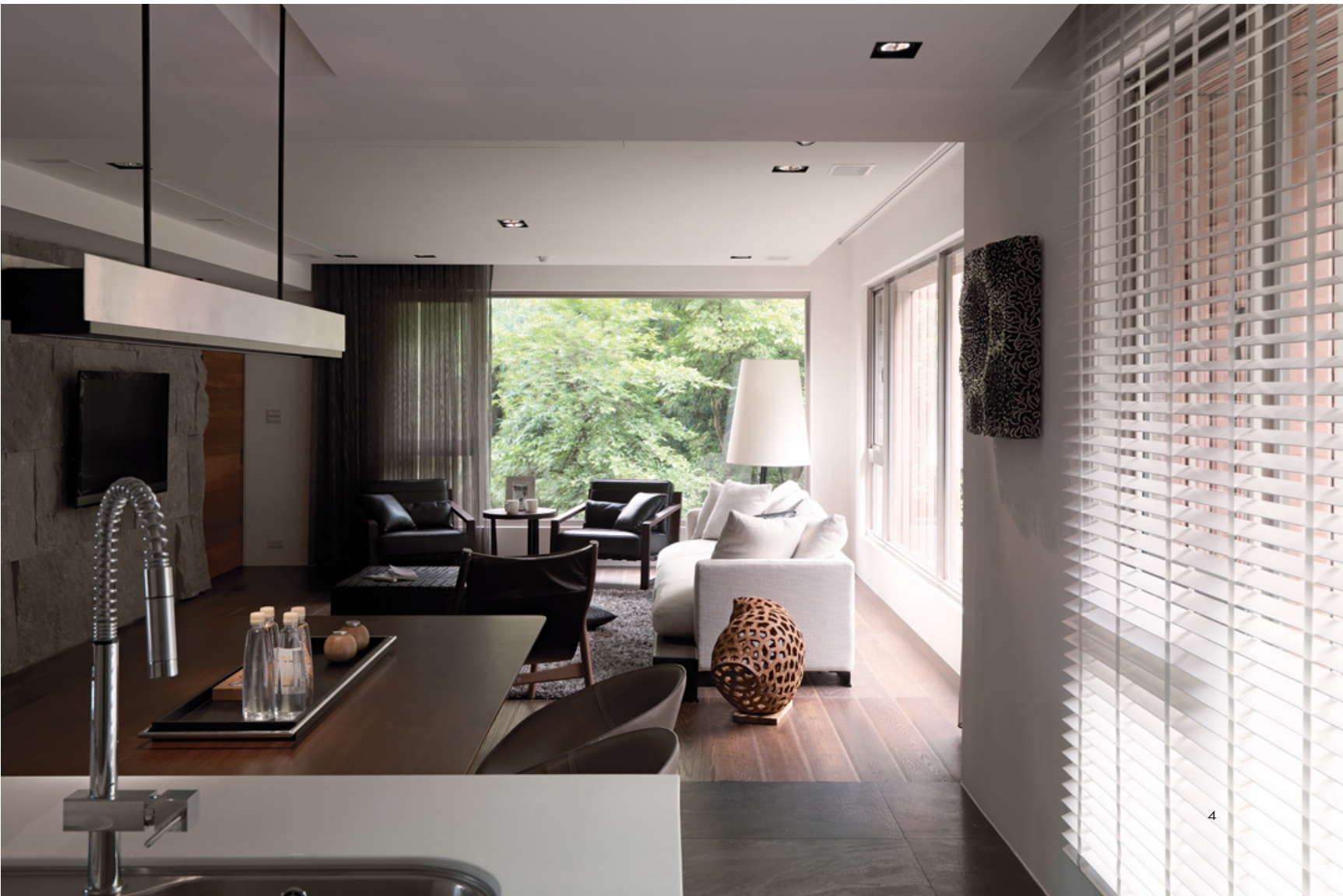
2. 以一開放性平面，連結戶外的綠蔭。3. 藉由牆面中移動的拉門連結或區隔，模糊空間界定。4. 空間內隨光影而生的自在隨意感。5. 從自然、光線與材質的運用切入，淬鍊出最精簡的空間本質。 3. Open flexible space links directly to the exterior landscape 4. Sliding doors are a mechanism that gives the apartment flexible space 5. Lighting quality inside the room 6. Nature, light and material are main themes of the space

設計概念 在山的前面 學會觀察風的姿態 學會體驗時間的流逝 學會如何放開自己 學會如何休息 由於整個基地擁有非常優良的基地條件，兩道迎向滿山綠意、幾無遮擋的落地窗，讓設計者站在現場感受到這片難得的景致時，決定以居住者心態去思考，讓空間以「靜」的姿態，來對應自然的生動。空間規劃由一道主要石材的牆面展開，區分了內外公私。由此，決定了一個開放的態度。讓每一個空間藉由牆面中移動的拉門連結或區隔，模糊了空間的界定，重新定義。 在主臥室的另一端，是設計者為居住者創造的彈性休閒空間，其中，另一個重要元素空間：臥榻，結合了窗邊植栽連貫了兩個場域，讓兩個看似獨立的區域卻又有一種開放性的穿透連結。可任意由居住者隨時間、心情，自由移動至不同區域角落，感受空間內隨光影而生的自在隨意感。 在此案中，設計師從空間中最原始的調性中著手，從自然、光線與材質的運用切入，淬鍊出最精簡的空間本質，讓一天的過程可以在空間充分享受一處一景，生活的空間本該如此。