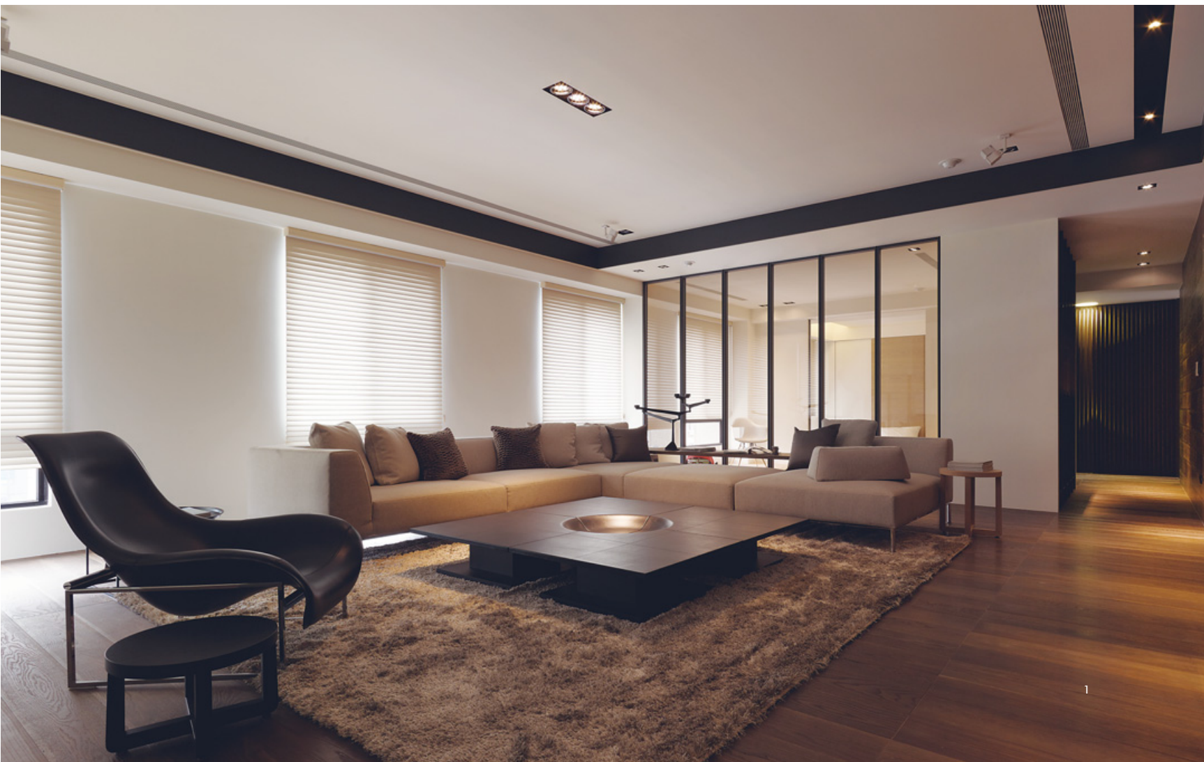
1. 客廳為主要的親子互動空間。2. 明亮的客廳與沉穩的餐廳互為對比。