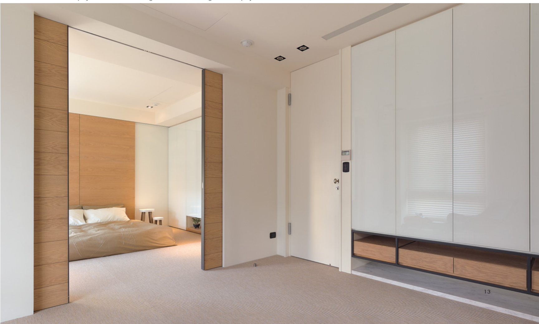
11. 遊戲間。12. 遊戲間與客廳間以透明玻璃推拉門相隔。13. 孩童房。14. 主臥室。 11. Child's play room 12. Glass sliding door allows the living room and playroom to connect 13. Child's room 14. Master bedroom

The first phase: The couple hoped their new apartment would offer space in two qualities: the first is a space to encourage interaction between the parents and child; while the second was to assure the intimacy of the couple. Final phase: The baby was born when the final plan was not yet finalized so it forced some slight changes to the the plan. The child's room and playroom were divided by a flexible partition that can easily be converted into a permanent partition.