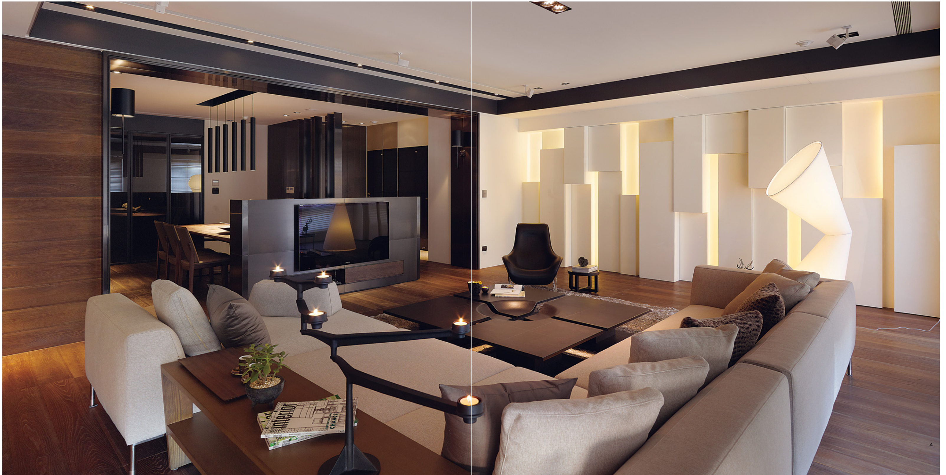
3. 客廳主牆面以活潑的幾何長形塊體造型呈現。4. 公共空間由兩種調性鋪陳，一是明亮的親子空間，二是都會沉穩的空間，作為夫妻獨處的角落。5. 客廳主牆立面圖。 3. Geometrical pattern forms the main partition in the living room 4. Public space has two characteristics- one shows a bright vivid air, the other displays a tranquil intimacy 5. Drawing of the main partition wall, living room