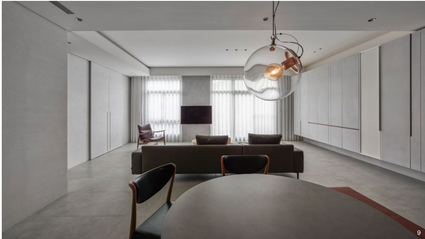
7. 餐廳區背牆以「燒杉」強化空間的溫度，廚具上方塗鋪仿鈦銅漆，色調的協調，讓場域轉折單純化。8. 刻意將書房兩側的收納櫃加厚，透過這些框料，使撞色塊體能依照觀賞距離的遠近，帶來多變的尺度感受。9. 具有充沛的自然光線，不過於強調人工光源，餐桌上方的垂掛燈具頗有畫龍點睛之效。10. 橘色長凳為訂製款，不僅能符合屏風尺度，下方還有收納功能；餐桌的水泥桌板與桌腳比例十分簡潔俐落，不會對畫面產生過多干擾。 7. Charcoal surface fir panel enforces the intimacy of the room. Tantalum color paint above the kitchenware has a strong impression associated with the kitchen space. 8. A cabinet shelf stands between two spaces and each has its own strong color appearance. 9. Ample daylight is the major lighting source in this apartment. 10. Orange custom design stool meets the height of the screen and functions as storage below the seat part.

Nic Lee has said: "All interior layout depends on a meticulous process to make the arrangements in color and space." This project reflects his typical design thought; the space has the least decorative elements but expose the nature of the materials. The space displays a sensitive touch by partition layering and the arrangement of a simple geometry.