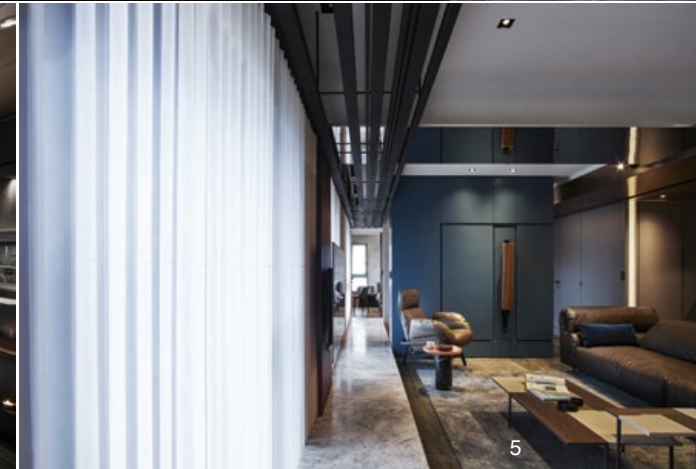
2. 呈長盒狀的公共空間，設計順勢利用一道中軸線上的橫樑劃出餐廳與客廳範疇，並利用天花材料強化分區定義。3. 玄關入內後的壁櫃收納空間，其木頭質地別異於金屬天花與石材地面，在分割效果下創造一種框景的意象。4. 靛藍色立面是空間轉折前的一道端景牆，機能上則是可彈性使用的多功能室。5. 貓道與長廊皆貼著窗牆而設，前進線條勾勒出水平尺度的深邃感。6. 平面圖。