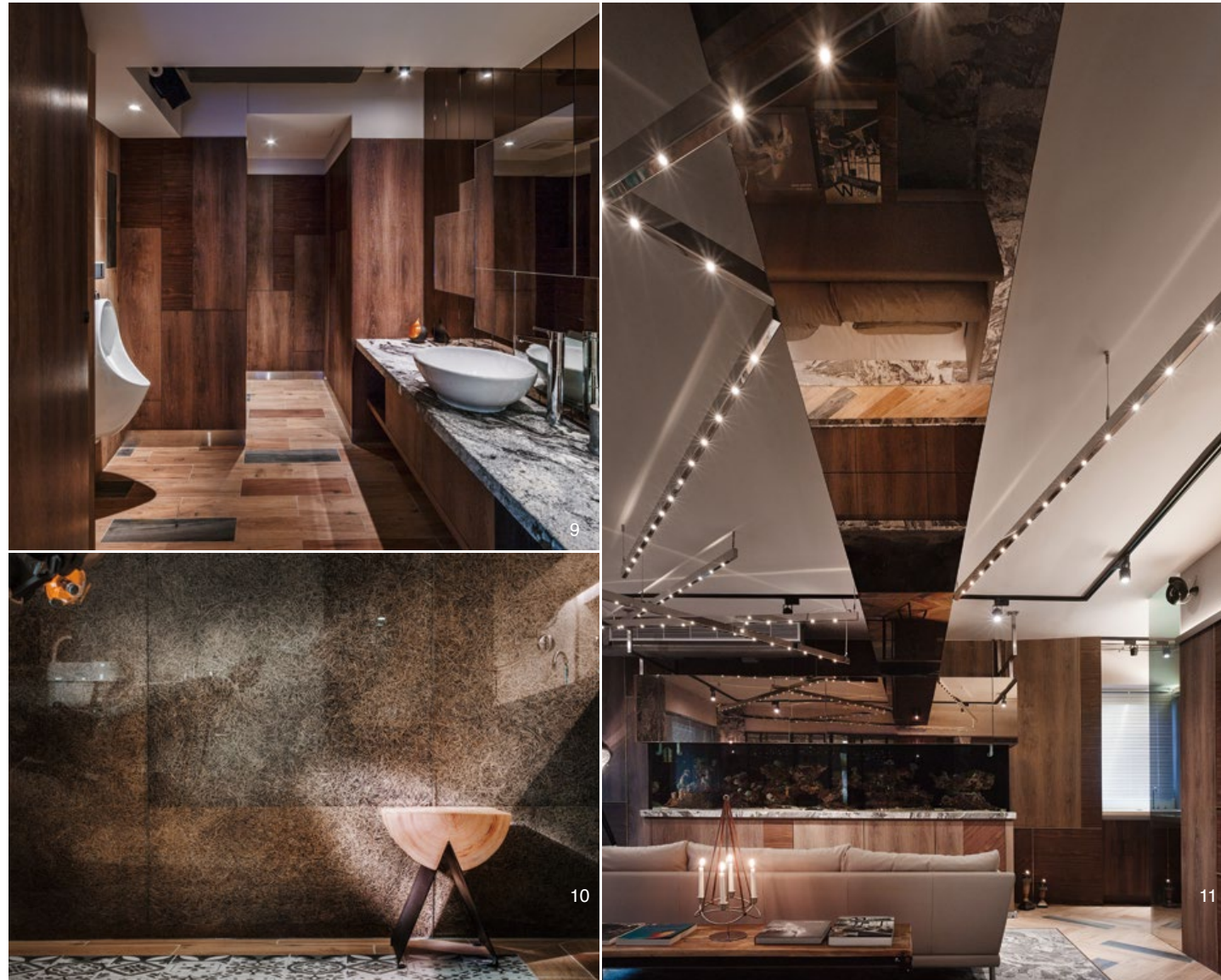
9. 廁所空間延續木皮語彙。10. 灰色鑽泥板圍起玻璃盒後，在光影作用下洋溢藝術情調。11. 鏡面不鏽鋼包樑映出絢麗之景。 9. Wood grain veneer vocabulary continues into the restroom space. 10. Cement wall board decorated with glass frame that reveal an artistic charm. 11. Mirror stainless steel beam cladding reflecting gorgeous views.

The old house's existing water leakage issue was technically inaccessible. Therefore, an alternative option was to use a breathable cement board finish material that allows moisture relief. By selecting a dense texture paint the unsaturated and low lux blue, green and gray colors resemble movie director Wong Kar-Wai style of nostalgia charm. Due to the higher sterilization requirements for the surgical procedure room, an additional glass box encloses the cement board detail to conceal the ventilation system. The glass box reflecting the surrounding objects diffuses the light source and resembles artwork.