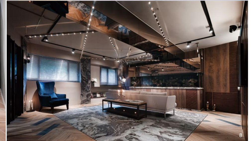
6. 接待櫃檯隱於反射玻璃房間後。7. 反射玻璃立面再以黑鐵強化視覺效果。8. 鑲嵌木地板中央的大理石儼如地毯。 6. Reception desk is hidden behind the reflective glass. 7. Reflective glass elevation with black iron details to reinforce the visual effect. 8. Marble inlaid wood flooring with carpet finish appearance.