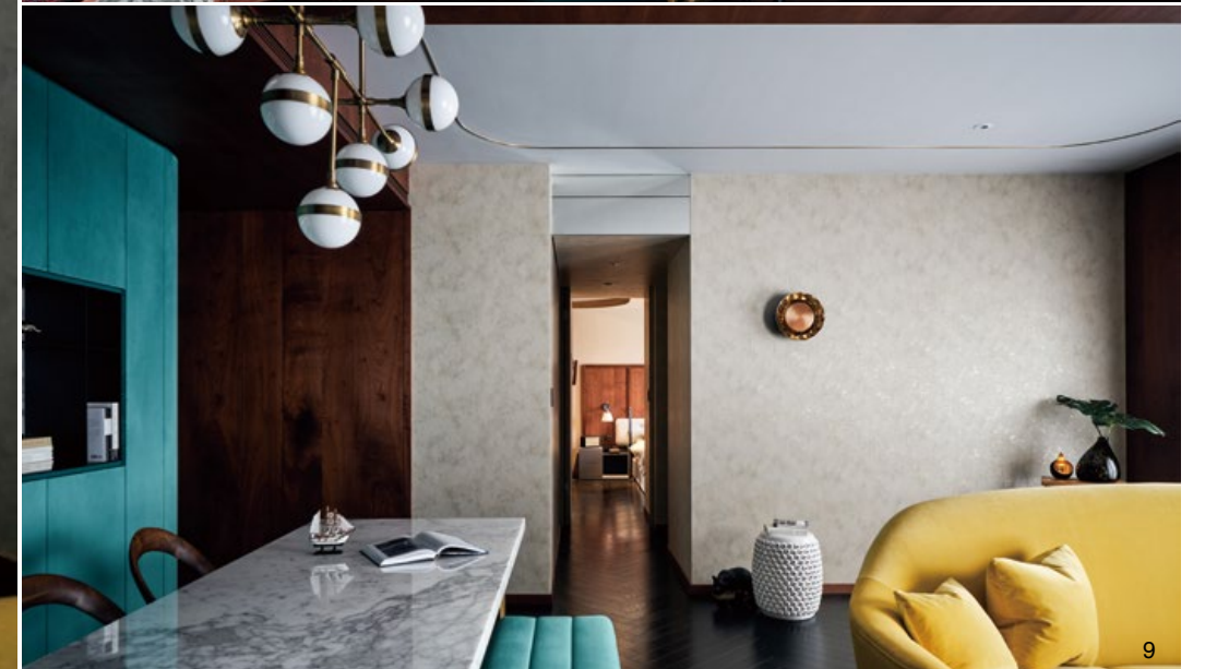
7. A blue color bandage wraps a wood surface - a dining room view. 8. Dining room view and its furnishing details. 9. Titanium plated ceiling and its delicate details.