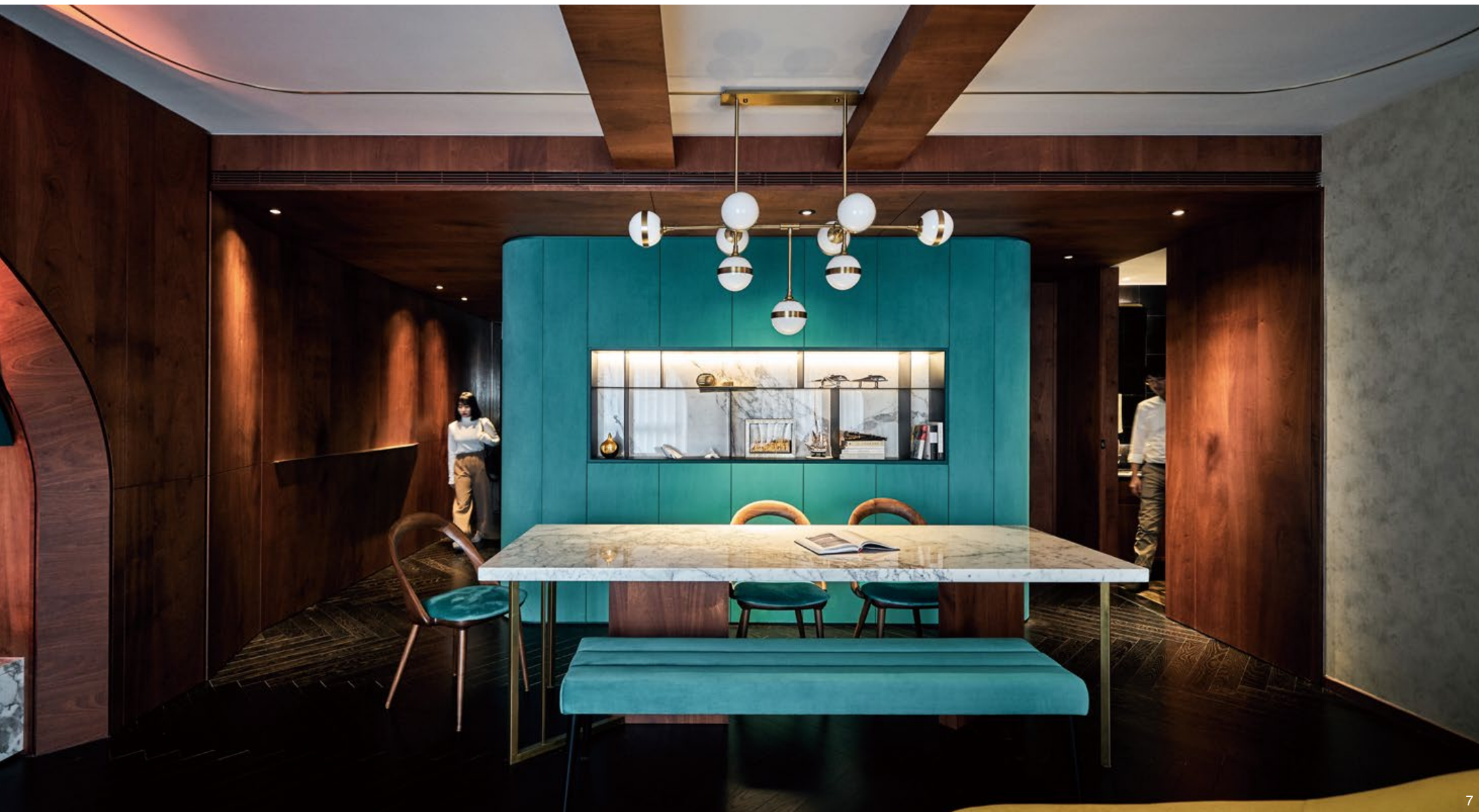
7. 餐廳一道藍色繙布牆置入木皮襯底空間，如此畫面優雅大膽，懷舊亦當代。8. 餐廳位於空間轉折處，設計將此區牆面以弧度進行整理，達到一種流暢調性。9. 天花在欄上鍍鈦收邊後，不僅輪廓更為鮮明，造型亦顯得更為精緻。