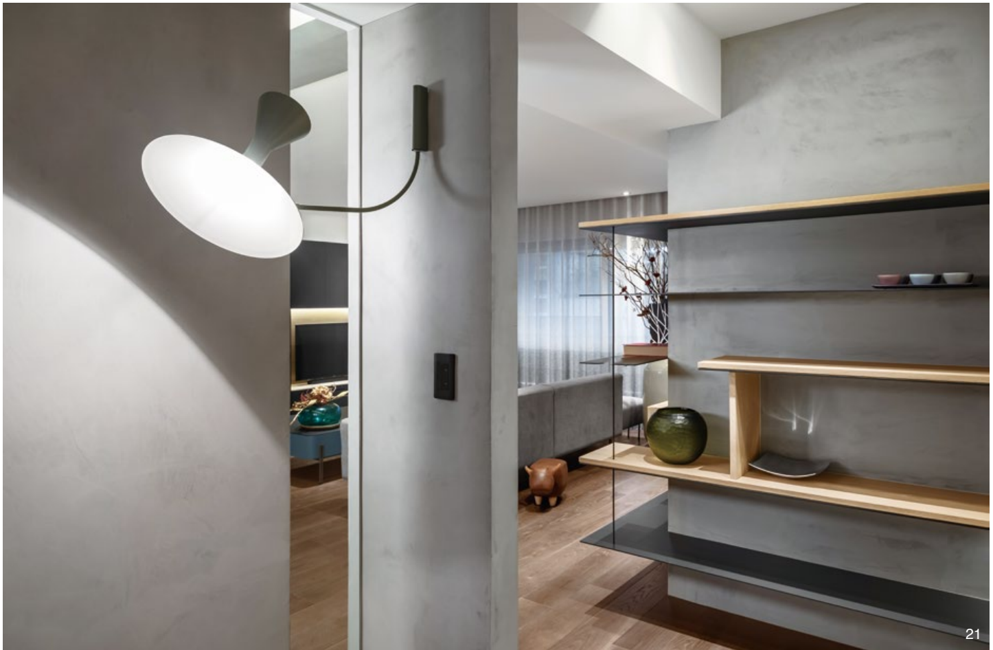
21. 書房利用立面開口、摺門與透光材質，維繫視線穿透感。22. 平面圖（妹妹住宅）。23. 臥房空間風格簡約，壁面與天花板延續公共空間的暖灰基調。24. 臥房採用兩進式動線，層層規劃睡寢區、更衣區與浴室。25. 主臥室更衣區。26. 主臥室衛浴。 21. Reading room has a light-penetrating material to set the border. 22. Plan (younger sister). 23. Bedroom uses a gray color tone material that provides a tranquil comfort. 24. Bedroom is divided into two zones. 25. Master bedroom joined with a walk-in closet. 26. Master bathroom.