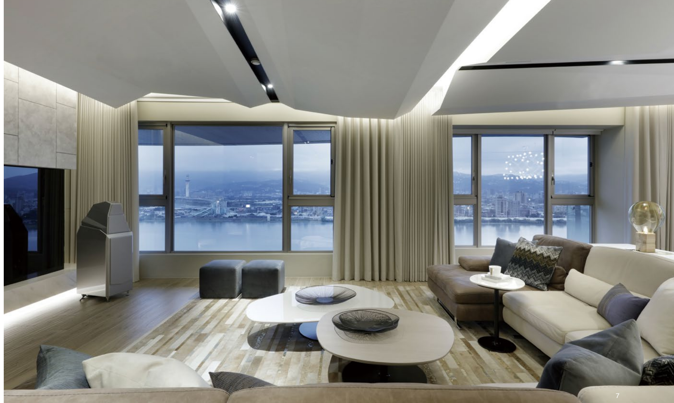
6. 獨立式廚房，流理檯背牆亦為格柵般的直線紋理。7. 客廳馬毛地毯流露陽剛韻味。 8. 瞻看廊道動態。9. 書房門敞開，視野便可直探窗外即景。 6. Island Kitchen with linear pattern back wall 7. Mohair carpet reveals the masculine quality of the living space. 8. Circulation overview 9. Open view from the study

There is an amazing sky top view of the greenery from this high-rise unit. It brings scenes of comfort into the space through a series of large window openings that embrace nature and the relaxing atmosphere. The designer, recalling his memories about the breath taking view, also remembered his first impressions of meeting the owner. With a scholarly appearance but carrying a straightforward boldness, the contrasting temperament gave the designer the idea of "space anthropomorphic" as the design concept. Chen said: "the owner's character and temperament really match up with the landscape momentum so it felt like the house was looking for the owner. Therefore, the design of the temperament of the visualization of space, the "mountain "was the inspiration for the design language and material selections' prototype. Chen Lianwu continued: "people's intrinsic temperament is in parallel with the mineral deposits at the bottom of the mountains." Moreover, the mineral treasure is mostly accompanied by gravel and other impurities, so the appearance is sometimes rough, sometimes smooth or both. The open plan living and dining space are connected by a folding plane ceiling whose profile is as abstract form of the surrounding mountains.