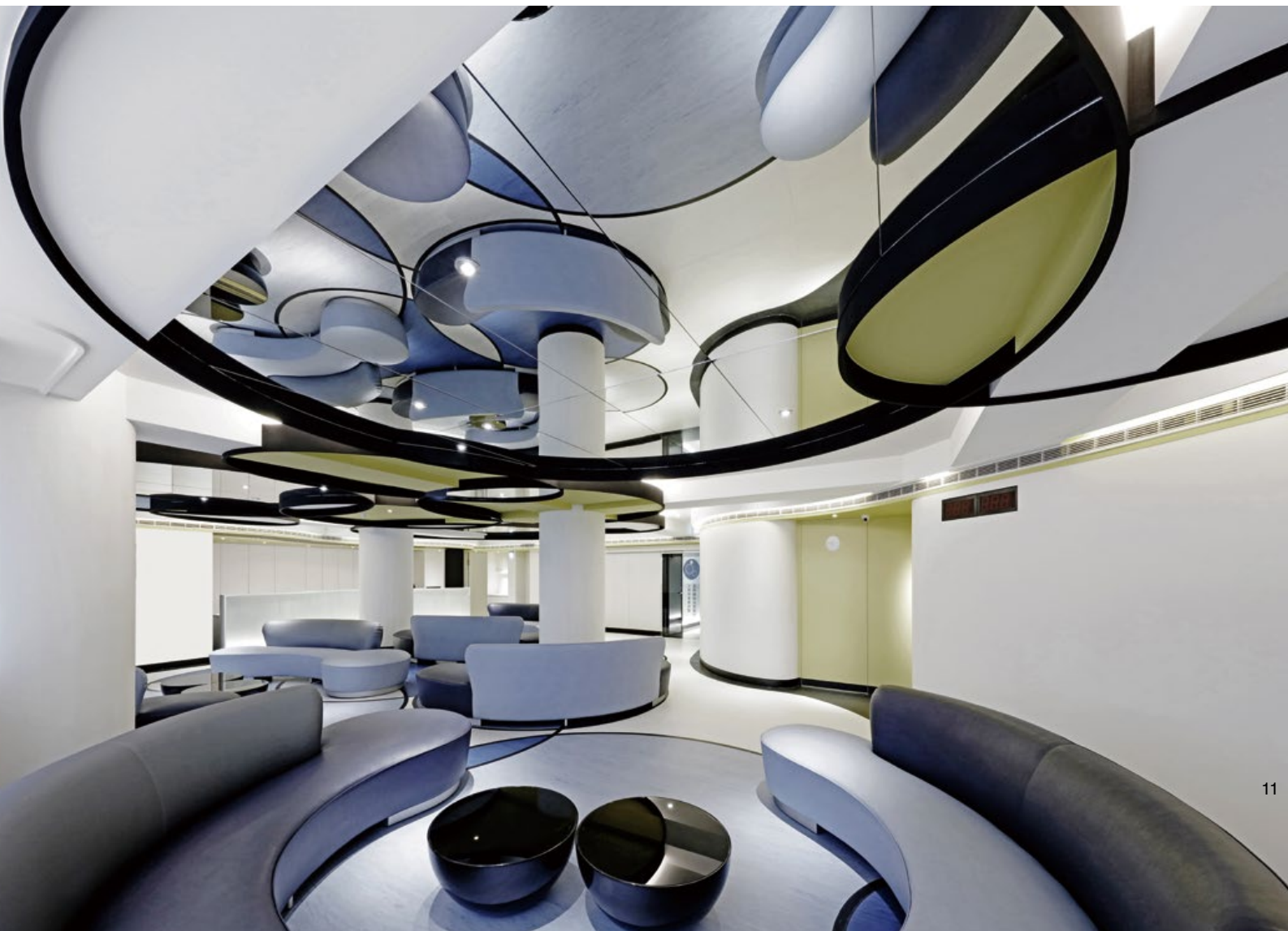
9. 天花以黃色和鏡體反射效果來豐富整體感。10. 錯疊的圓象徵細胞分裂，也彷彿探戈男女雙舞時的曼妙步伐。11. 鏡子的運用讓空間色彩即便只有藍與黃，卻能瞬間豐富起來。12. 黑色線條從踢腳板延續至天花圓型鏡體的外框。 9. Small box with yellow ceiling with mirror reflection effect to enrich the space. 10. Overlapping circle of symbolic cell division like a tango's graceful dance pattern. 11. Cleverly utilized mirror in space, instantly enriches the visual experience. 12. Black lines extend from the wall base to the the ceiling plane.