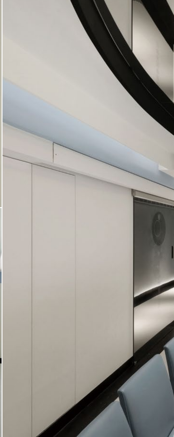
13. 前往手術室和實驗室的內部廊道。14. 廊道另一端的會議室，將卵形語彙作收斂詮釋。15. 會議室空間氛圍理性，顏色僅取用藍與白。16. 平面效果圖。17. 平面圖。 13. Internal circulation corridor leads to the operating room and laboratory 14. Conference room on the other side of the corridor, the oval language of convergence. 15. Conference room with rational atmosphere. 16. Plan presentation. 17. Plan.