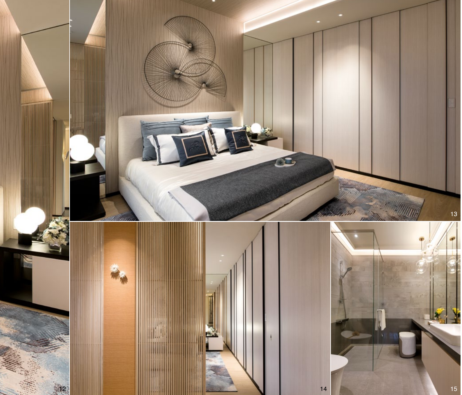
12. 最後來到冬日的次臥，以藍天、白雪為主調，搭配木材溫潤手感，迎來溫暖的冬季風貌。13. 與多功能房相隔的牆面，改以深藍色調，並將擺飾、地毯換上如冰如雪的色澤和紋路。14. 房內演繹著秋天轉紅的樹葉、熟透的穀禾與棕色木皮，在溫暖中又夾帶絲絲寒意。15. 浴室。