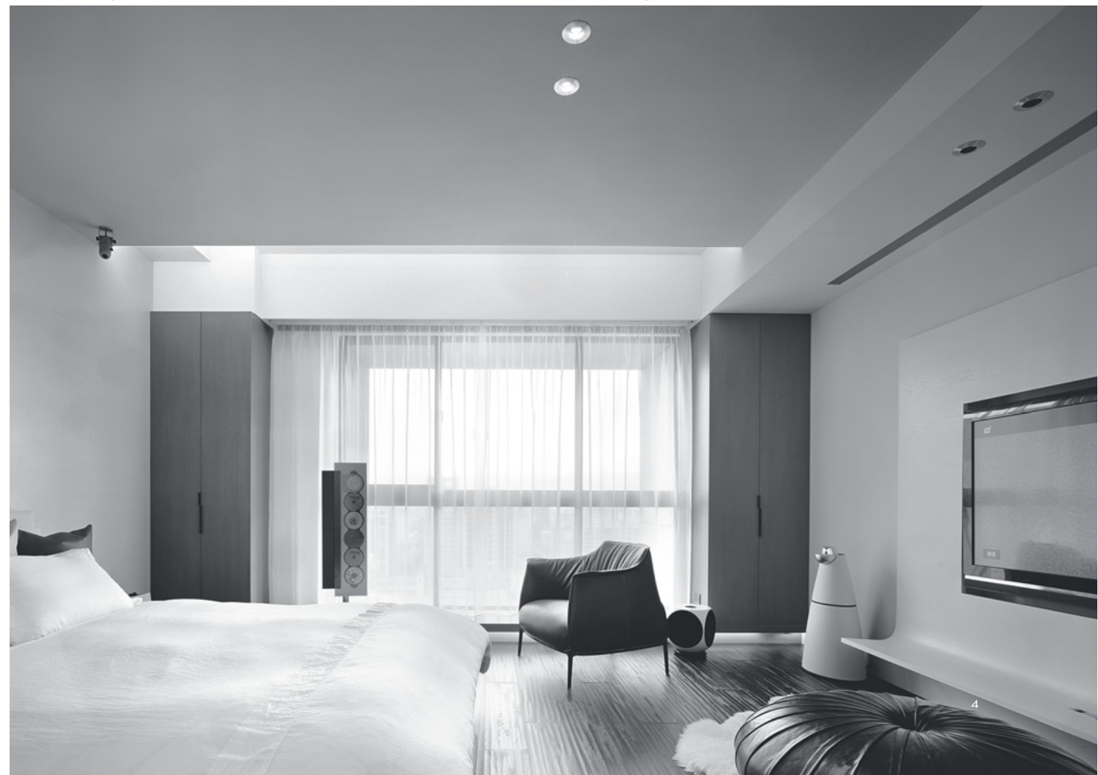
3. Bar table design is derived from treble clef and some surreal element taken from Salvador Dali's painting 4. Master bedroom