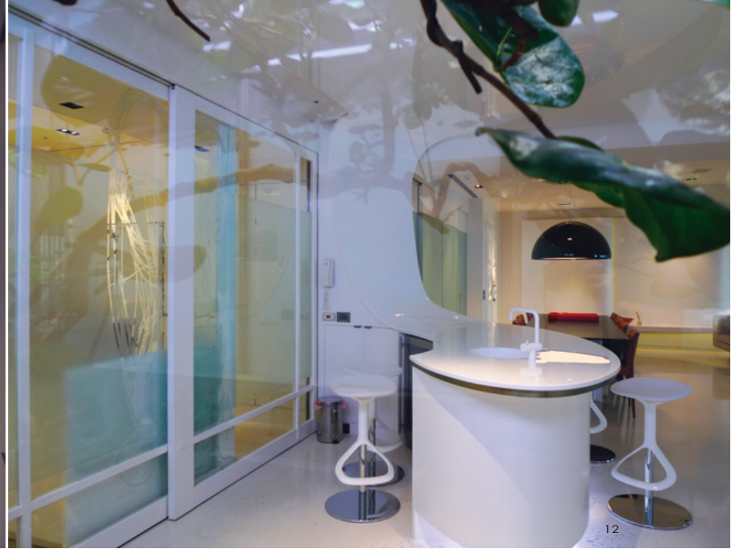
10. 利用滑軌門片，維繫動線及視感開闊的特色，讓視景能觸及花房風景。 11. 緊臨花房的吧檯，是屋主最喜愛的場域，引人視線自然而然的凝望綠意。 12. 藉由花房，將大自然裡舒適的陽光、空氣、水、綠意等元素，合理而微妙的轉嫁至都會居家內。 13. 吧檯設計手稿轉變為廚房噴砂玻璃門片的圖騰。14.15.16.17. 吧檯設計記錄。 10. Sliding door can open up a view directly to the garden 11. Bar table adjacent to the garden is everybody's beloved spot in this family 12. Garden places city dwellers submerged under natural air, light, water and greenery 13. Image appears on top of translucent glass 14.15.16.17. Drawings show how the bar table evolved from hand sketches