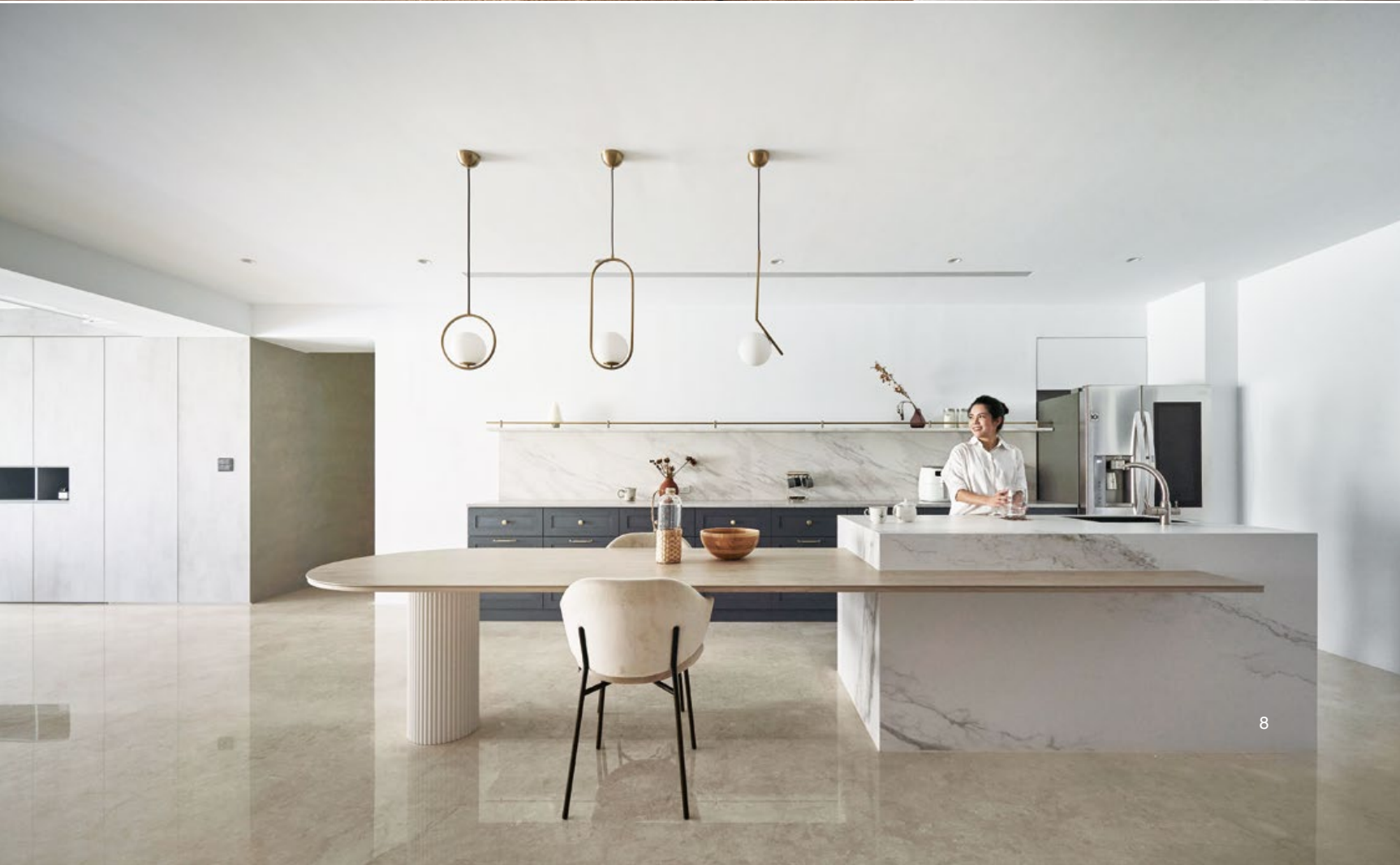
7. 空間整體多為沉穩木質調，於層架中飾以業主喜愛的灰藍色系，作為放置視聽播放器或展示品使用。8. 中島區。檯面以木紋薄磚製成，具備酒精清潔不褪色的優點。9. 除基礎照明外，設計師更針對業主的習慣，布局了適宜的情境光源。10. 本案未設固定的電視牆，而是改使用電動投影幕。 7. The floor is mostly covered by wood flooring and the living zone is defined by audio-video equipment shelves. 8. A central island table covered by tiles. 9. There are several lighting mode designs, custom-modified by engineers. 10. There is an electronic controlled screen.