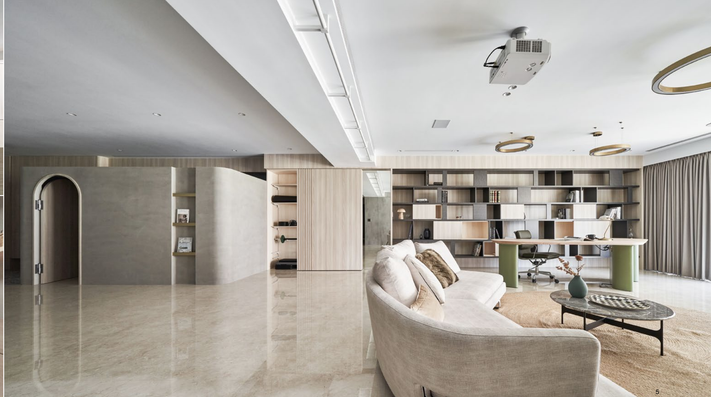
3. 玄關落塵區以復古的手繪花磚拼貼而成。4. 消毒儲藏空間。配有蒸氣電子衣櫥，以及多元收納方式，如洞洞板、平台等。5.6. 保留寬敞過道，並在樑上設置整排單槓，全身鏡和推拉門（收納器材）的運用滿足了居家中的運動需求。