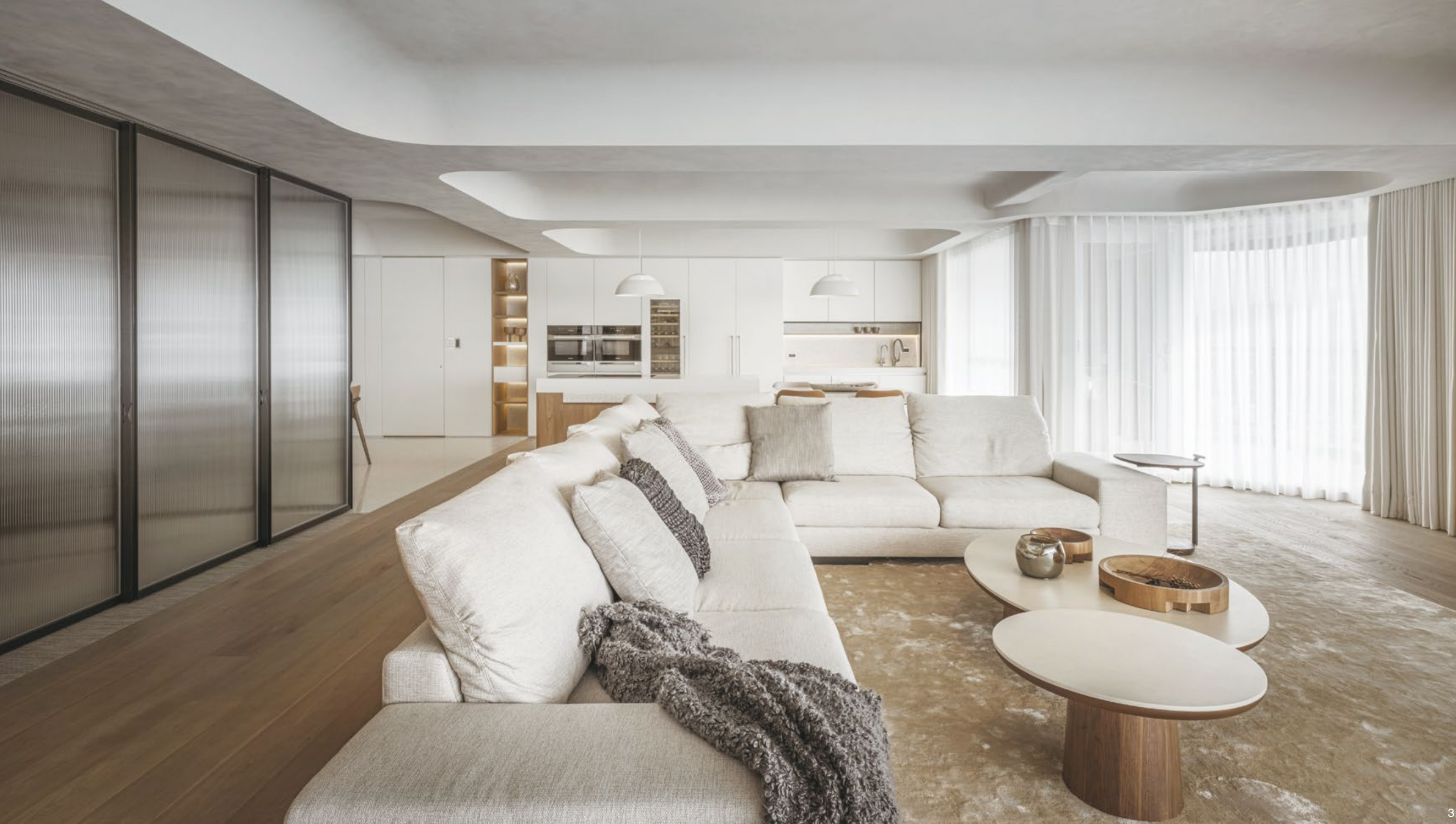
3. 公區整體開放通透，透過天花板造型塑造空間分界。4. 電視櫃造型呼應天花板圓弧線條。 3. Public zone has many featured formations in the ceiling types that implicate zoning for different use. 4. The shape of the TV cabinet dialogues with ceiling formation.