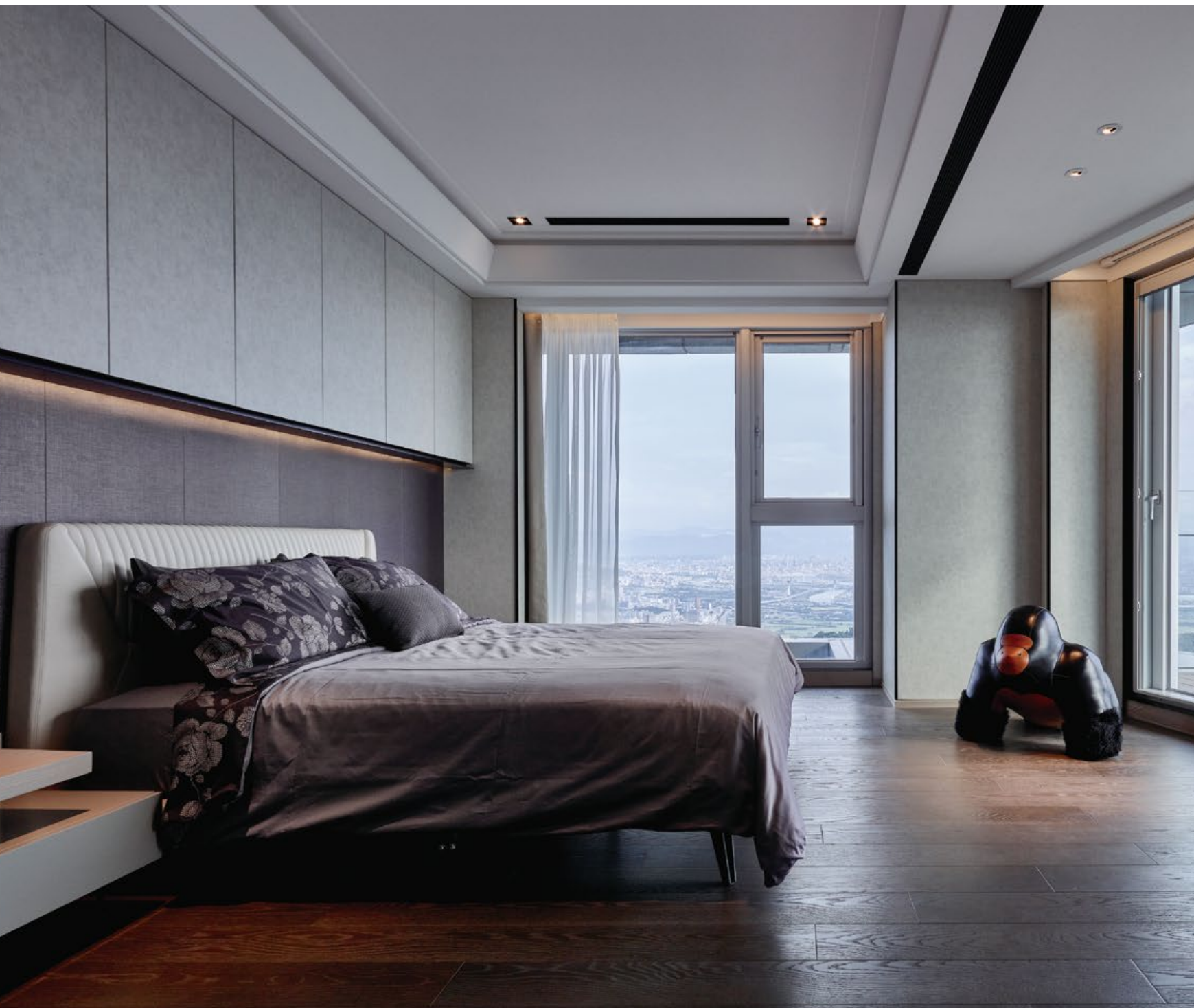
9. 臥房皆具大片落地窗景觀。10. 主臥室的床頭背板，以皮革加絨布材質，呈現柔和感。11. 主臥房浴室在洗澡沐浴時，可以享受大片景觀。 9. Each bedroom is equipped with a huge floor to ceiling window. 10. Bed headboard is covered in leather. 11. Taking a bath one can enjoy the terrific outdoor view.