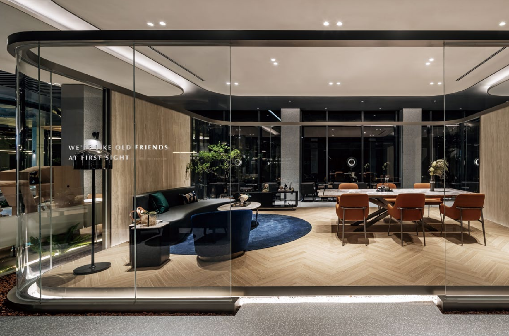
10. VIP 包廂，提供多人聚會使用。11. 兒童遊樂區，兼顧家庭用餐需求。12. 洗手間內部，淺色木材跳脫用餐區視覺。13. 洗手台設計結合玻璃盒及植栽，創造生活與自然相融之感。14. 盥洗區以拱門造型延續圓弧語彙。