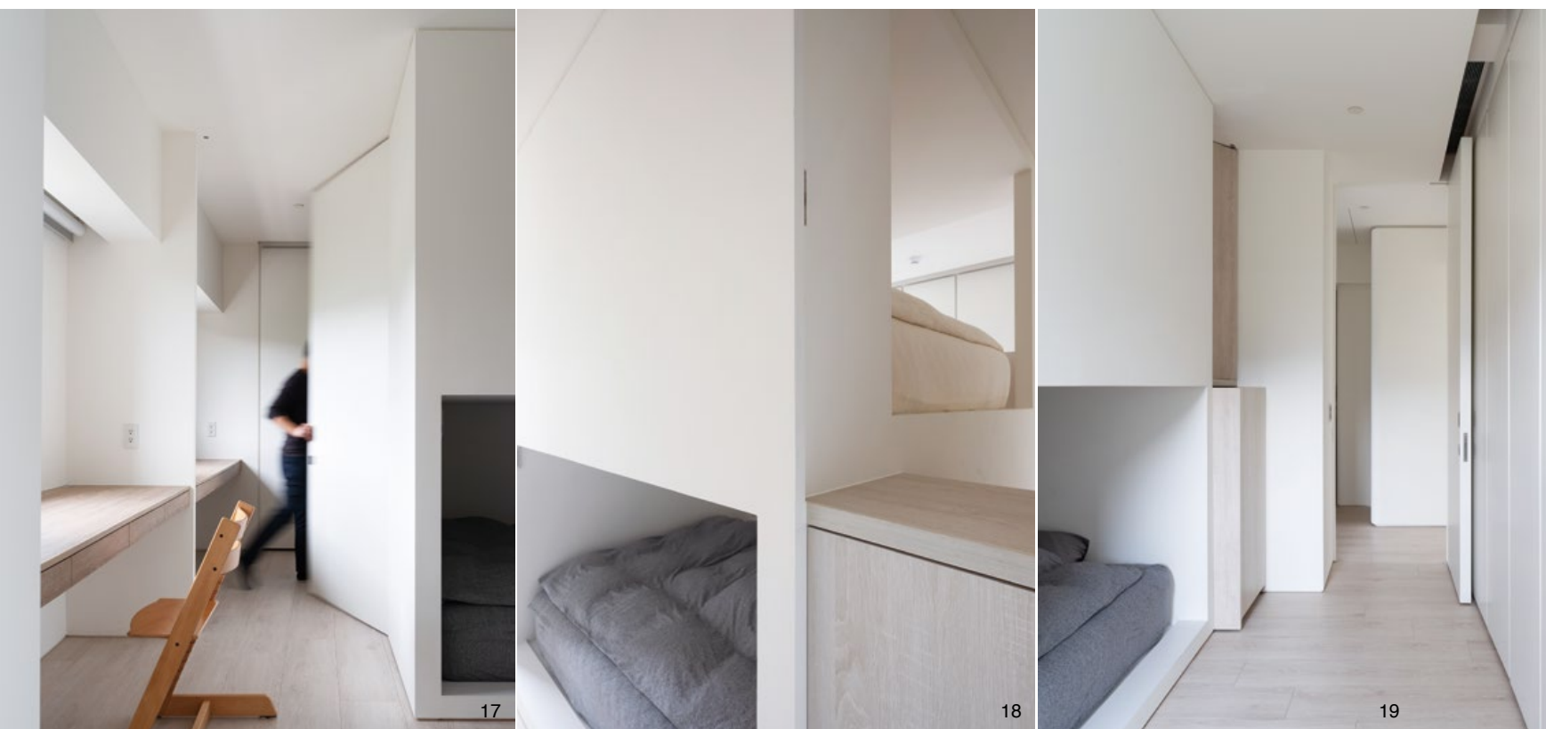
15. 兩個孩子共同使用的上下舖規劃，使用上各自獨立。16.17. 孩房的書桌靠牆，留出走動空間，將採光最佳處留予閱讀區。18.19. 孩房方艙式的睡寢區以其相反開口連往所屬臥室。

15. The two tier bunk beds for the two children are planned to be used independently. 16.17. children's room reserve the best natural lighting zone for the reading. 18.19. View into the children's sleeping space.