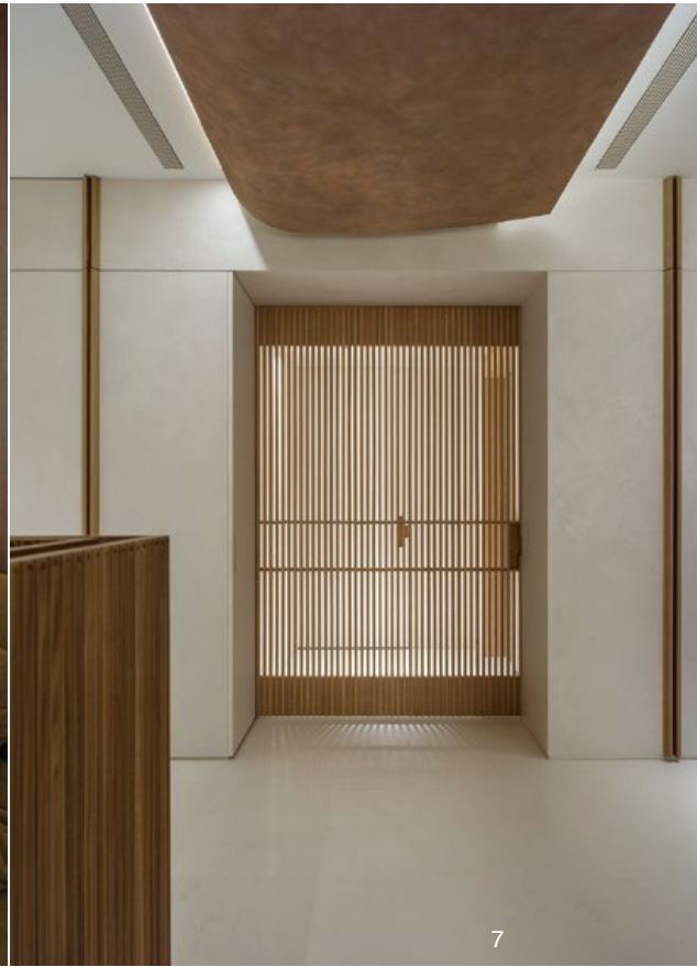
5. 以弧線修飾橫樑、劃定場域，同時鋪陳間接光源，讓光照溫柔地漫入空間。6. 長吧台像是一座半高的屏障，在開放廳區裡劃出一座相對具有隱私感的品酒空間。7. 公私領域之間以格柵門分界，確保臥房區的隱私。8. 平面圖。 5. Curved lines soften the beams and define areas while providing indirect lighting. 6. The long bar acts as a semi-high barrier, creating a relatively private wine-tasting area within the open living space. 7. A grille door separates the public and private areas. 8. Floor Plan.

The L-shaped floor plan of the residence is divided into two parts. One is the rectangular area connected to the main entrance, serving as the public space; the other is the inner rectangular area, defined as the bedroom zone. The public space focuses on functional integration and a clear, spacious visual aesthetic, allowing one to fully appreciate the surrounding scenery in the open area. The walk-in closet, storage room, kitchen, workspace, and maid's room are concentrated in the peripheral corner, while the living room, dining room, bar, and wine tasting area are openly connected, receiving light and expansive views from the large floor-to-ceiling windows. The designer aimed to achieve a sensible and flexible layout within the space, allowing the shared areas to reflect various possibilities of human