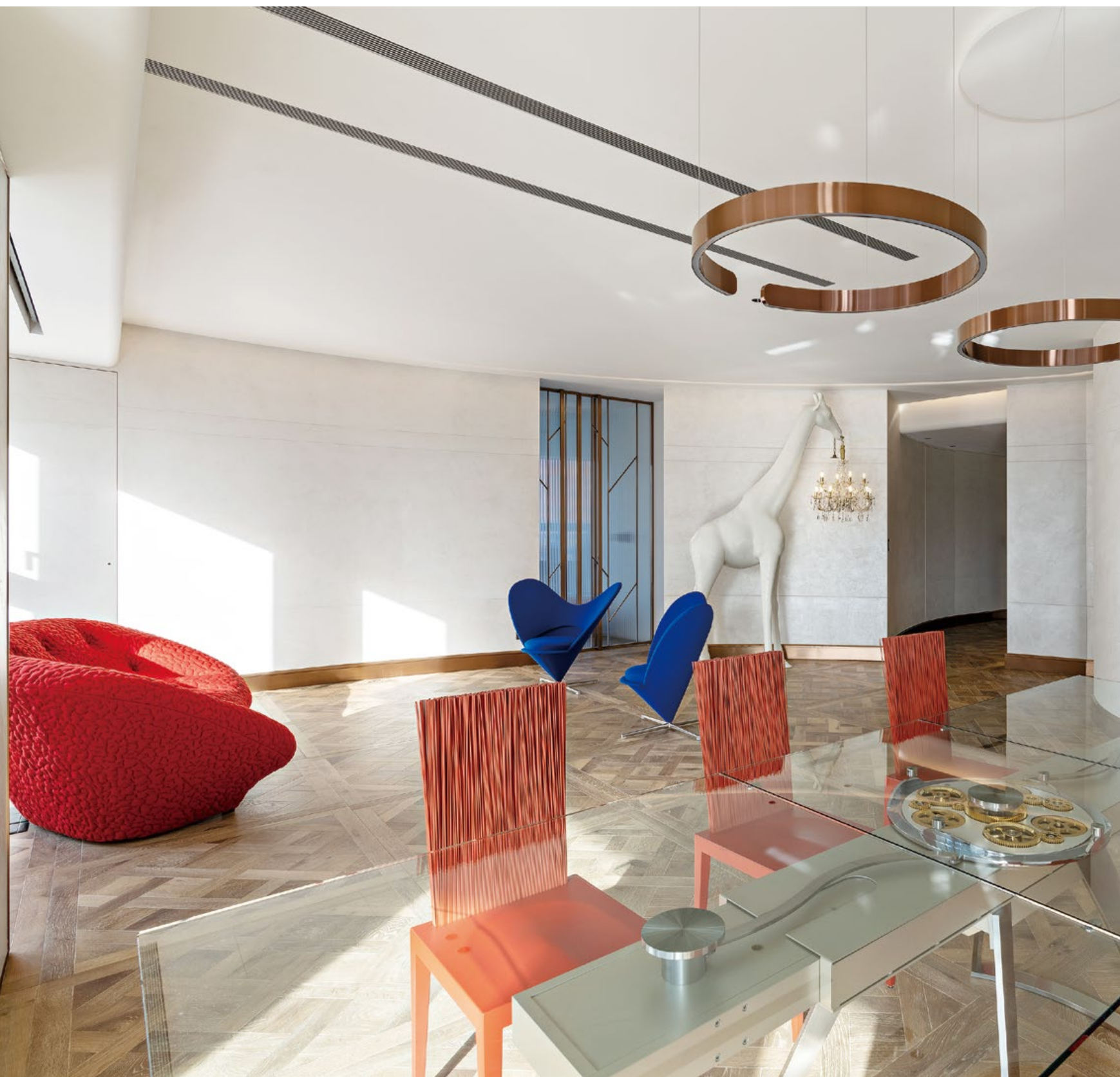
3.4. 廳區利用弧牆的微包覆感，將大窗注入的光線反射的更加明亮。 3.4. Curved wall wraps a space while gathering natural light in a gentle style.